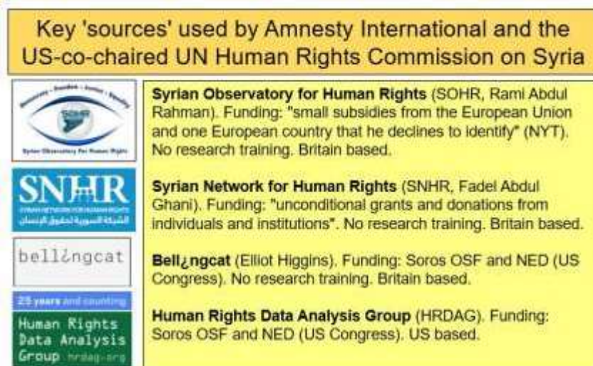
Graphic 1: Key sources of 'information' on Syria are mostly funded by the same western governments that provide weapons to the anti-government armed groups

Nevertheless, UN commissioned groups and Amnesty International make use of 'data' from the SOHR, the SNHR and another similarly compromised US-based group called the Human Rights Data Analysis Group (Price, Gohdes and Ball 2014). This HRDAG gets funding from US foundations, including George Soros' Open Society Foundation, and directly from the US Government through the Congress funded National Endowment for Democracy (NED) (HRDAG 2017). That group, in turn, said 'four sources were used for this analysis ... Syrian Center for Statistics and Research (CSR-SY), Damascus Center for Human Rights Studies (DCHRS), Syrian Network for Human Rights (SNHR) and the Violations Documentation Center (VDC) (Price, Gohdes and Ball 2016: 1). Those are all anti-Syrian government sources, networked together. Similarly, an untrained researcher and blogger Elliot Higgins, with his small group called Belling Cat, reinforces the US 'war narrative' against Syria. Higgins admits that his group receives money from (amongst others) the Open Society Foundation (run by billionaire George Soros) and from the US government funded NED (Higgins 2017). Graphic 1 shows this network of partisan and western government funded sources. Collaboration in a one sided war narrative was sought and bought from these and other agencies. Let us turn now to the role of the larger, better known human rights agencies.